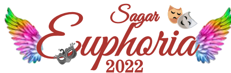
Annual Techno-Cultural Fest