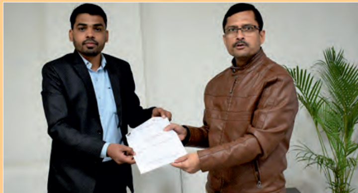
4. MoU with K I Technologies