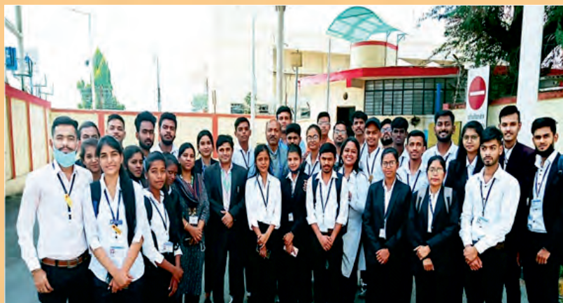
Industrial visit to Airport Authority of India (AAI) by Electronics & Communication Engg. Department