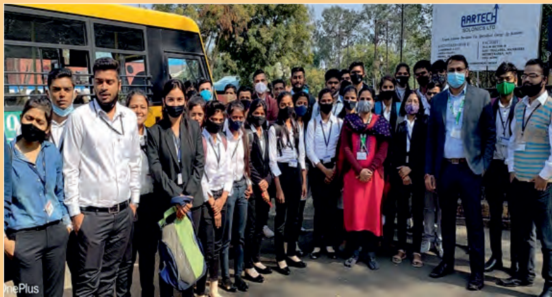
Industrial visit to Artech Solonics Ltd. by Electronics & Communication Engineering Department

Industrial visits provide an insight on how companies work and also useful information related to the practical aspects of the course which cannot be visualized in lectures. Industrial visits are an eye opener for the students who visit companies and get insight on the internal working environment of the company. Industrial visits also give greater clarity about various management concepts for students as they can practically see how these concepts are put into action.