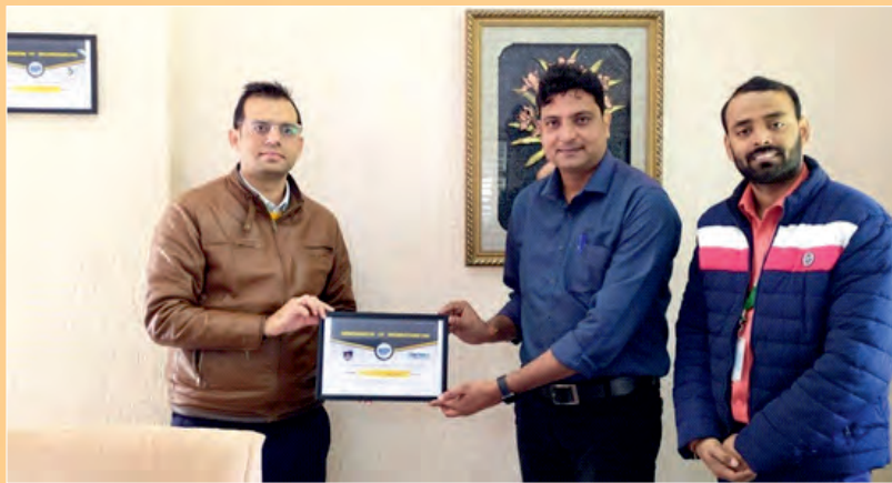
1. SIPTec signs MoU with Scan Research Lab

Institute signed MoU with various entities to promote great academic objectives, inculcate a spirit of research, improve technical skills through expert talks / seminars / workshops / summer training programs / paid internships, and support placements for the students.