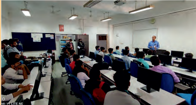
Industrial visit to CRISP by Electrical & Electronics Engg. and Computer Science Engg. Department