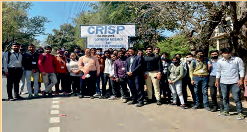
Industrial visit to Artech Solonics Ltd. by Electronics & Communication Engineering Department