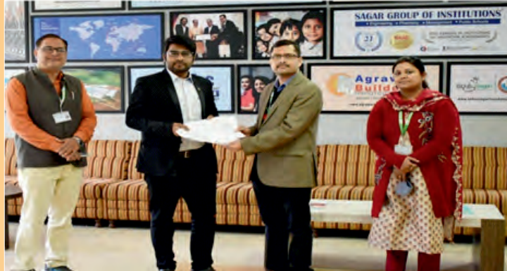
3. MoU with DhiyoTech Pvt. Ltd.