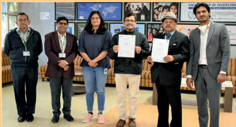
2. MoU with Star iGlobal Pvt. Ltd.