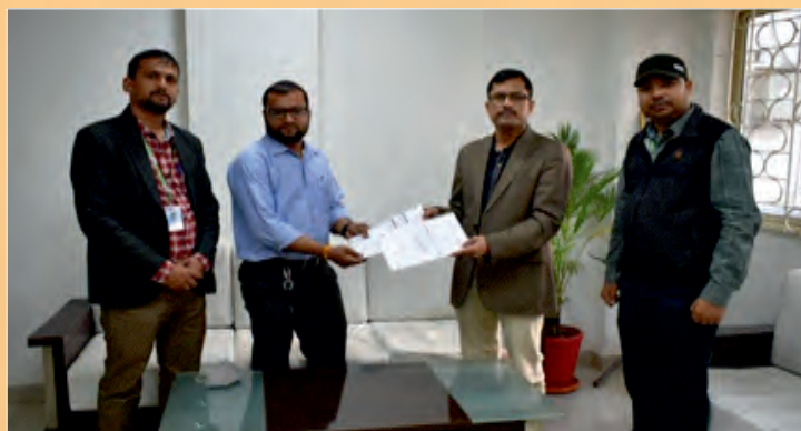
5. MoU with Sriaan Electric Vehicle Pvt. Ltd.