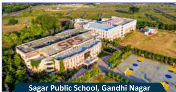
Sagar Public School, Gandhi Nagar