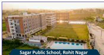
Sagar Public School, Rohit Nagar