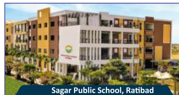
Sagar Public School, Ratibad