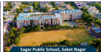
Sagar Public School, Saket Nagar