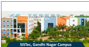
SISTec, Gandhi Nagar Campus