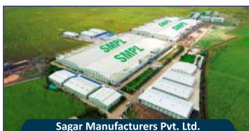
Sagar Manufacturers Pvt. Ltd.