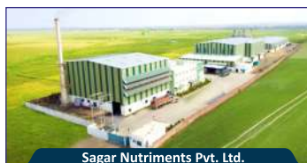
Sagar Nutriment Pvt. Ltd.