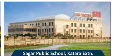
Sagar Public School, Katara Extn.