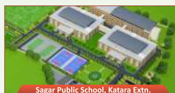
Sagar Public School, Katara Extn.