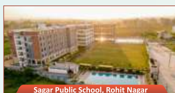
Sagar Public School, Rohit Nagar