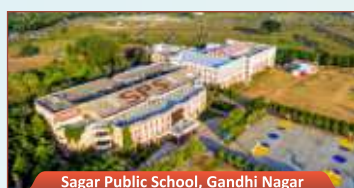
Sagar Public School, Gandhi Nagar