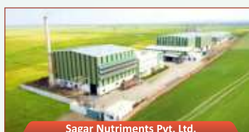
Sagar Nutriment Pvt. Ltd.