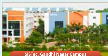
SISTec, Gandhi Nagar Campus