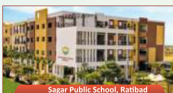
Sagar Public School, Ratibad