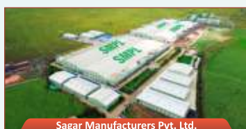
Sagar Manufacturers Pvt. Ltd.