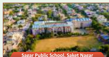
Sagar Public School, Saket Nagar