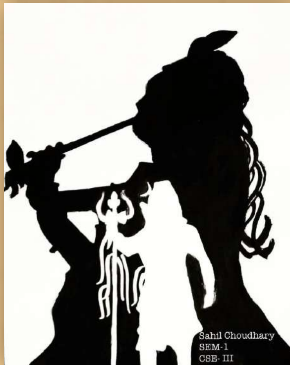
Sahil Choudhary CSE 1 st Sem