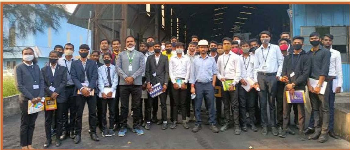
The students from the Dept. of Mechanical Engineering went for a One-Day Industrial Visit to Amtek Auto, Mandideep.