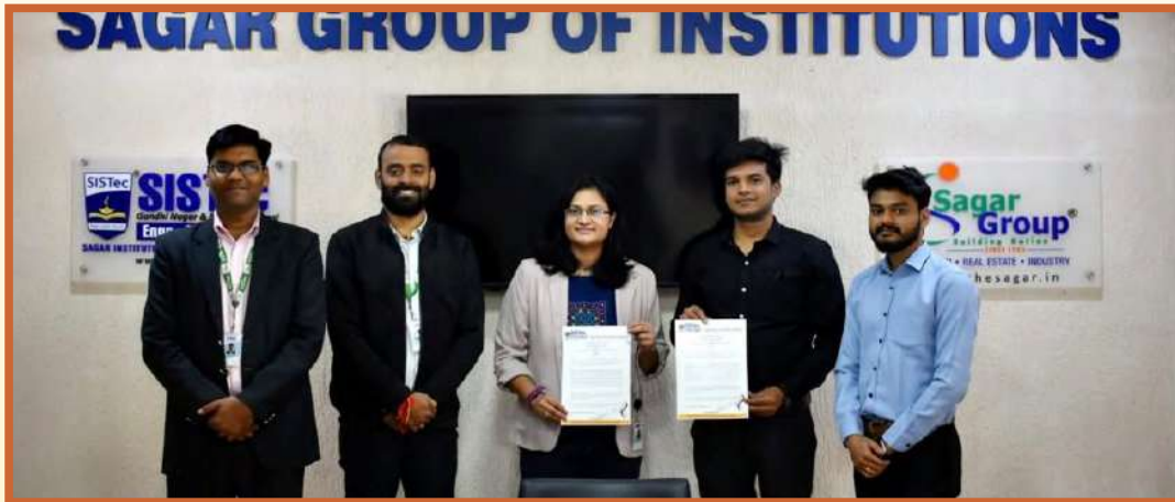
MoU with Rentozo

SISTec Ratibad signed MoU with various entities to promote great academic objectives, inculcate a spirit of research, improve technical skills through expert talks / seminars / workshops / summer training programs / paid internships, and support placements for the students.