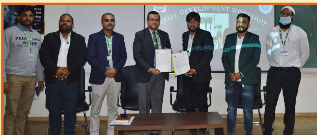
MoU with PSSN Infraprojects Pvt. Ltd.