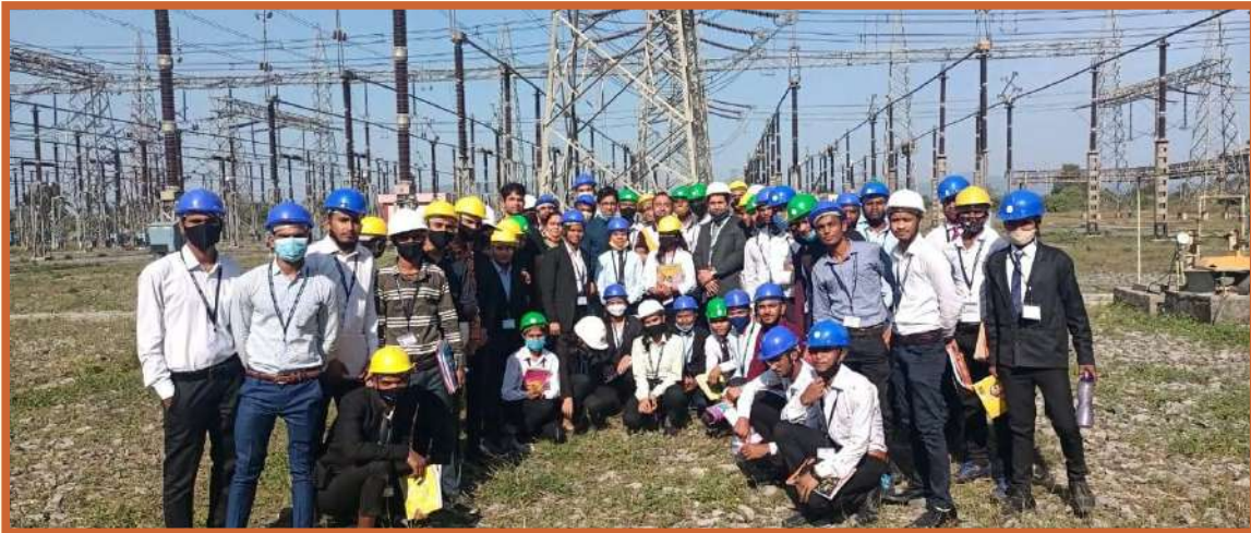
The students from the Dept. of Electrical Engineering went for a One-Day Industrial Training in Satpura Thermal Power Station, Sarni.