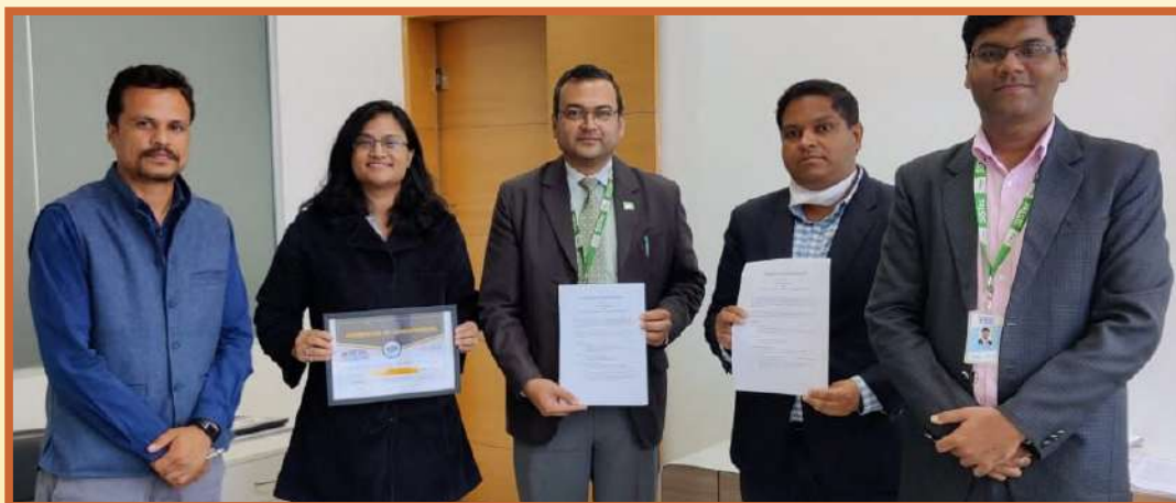
MoU with B-Nest Incubation Centre of Bhopal Smart City Corporation Ltd.