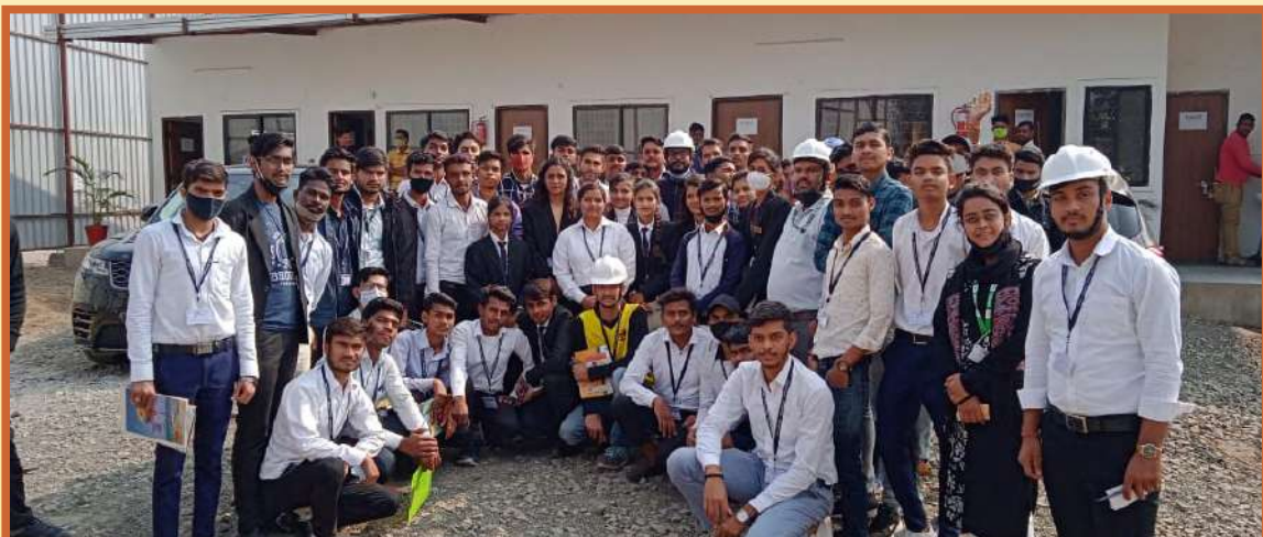
The students from the Dept. of Civil Engineering went for a Site Visit to Sagar Multi-speciality Hospital, Bhopal.