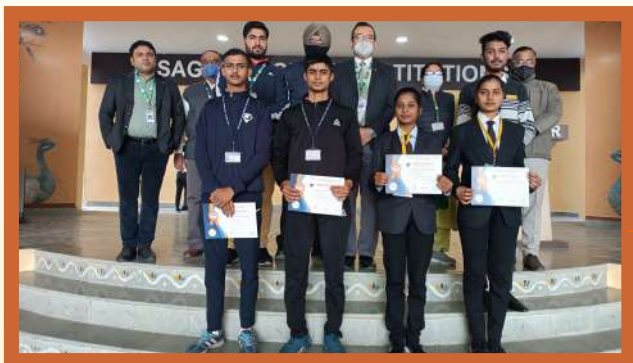
RGPV Nodal Level Yoga Tournament Winners