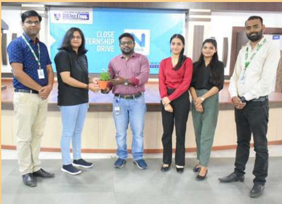
NetLink Internship Drive – Batch 2022 Profile : Software Intern

Sagar Group of Institutions - SISTec: A Gateway to Placements and The Best Place for learning, where the students are provided with customized training based on their skill-set in order to get that extra edge over their competitors.