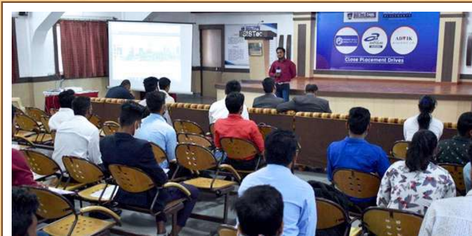
Companies: Advik Hi-Tech Pvt. Ltd. Grupo Antolin Premier Seals Pvt. Ltd. Profile: Graduate Engineer Trainee Location: Pune