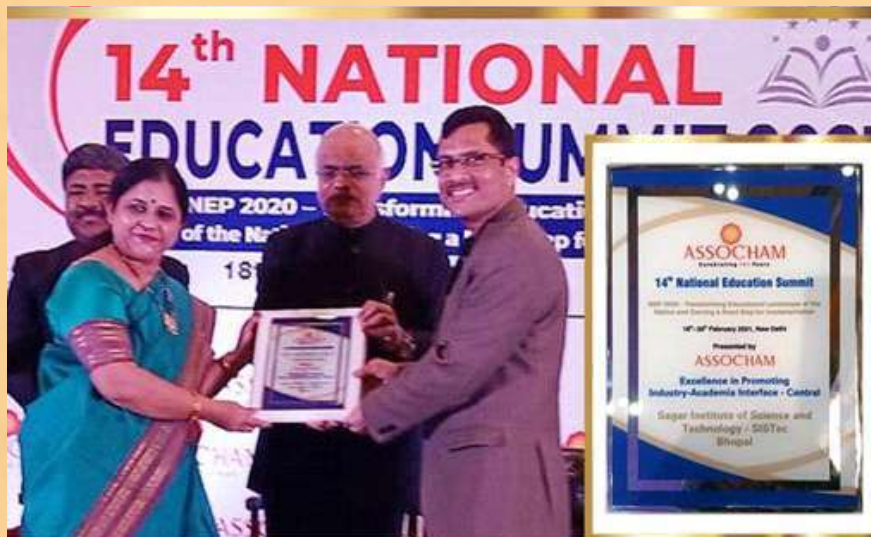
SISTec awarded with ASSOCHAM Award of "Excellence in Promoting Industry-Academic Interface" At the 14th National Education Summit & Annual Excellence Award 2021

Moment of immense pride for Sagar Institute of Science & Technology - SISTec, which has bagged the prestigious Assocham Award for "Excellence in Promoting Industry-Academic Interface" in the 14th National Education Summit & Annual Excellence Award 2021 on NEP 2020 – Transforming Educational Landscape of the Nation and carving a Road Map for Implementation.