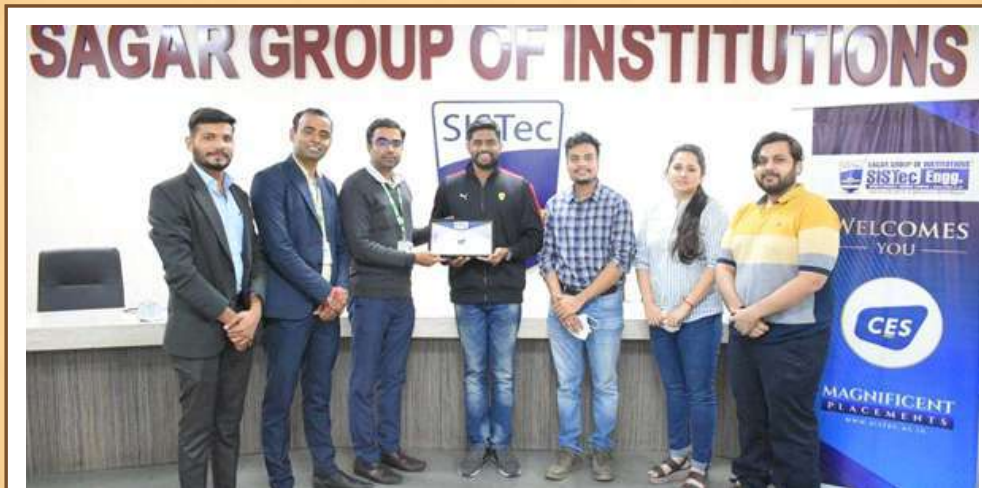
Company: CES Location: Chennai